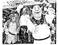
COUP: Todd Coates with Puss in Boots and Shrek.